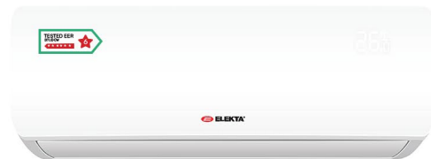
Split Air - Conditions