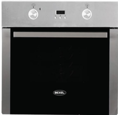
Built In Oven