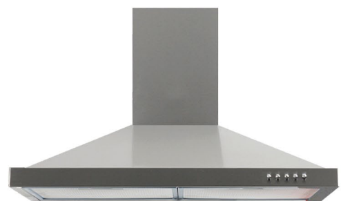
Built In Hood